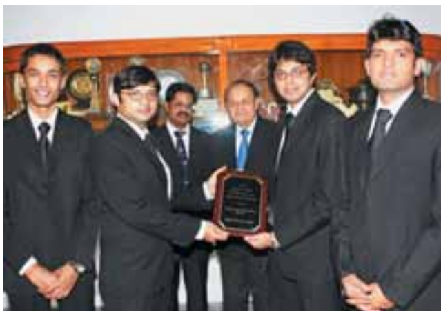
Phillip C. Jessup International Moot Semifinalists (Third Position) Washington, D.C.