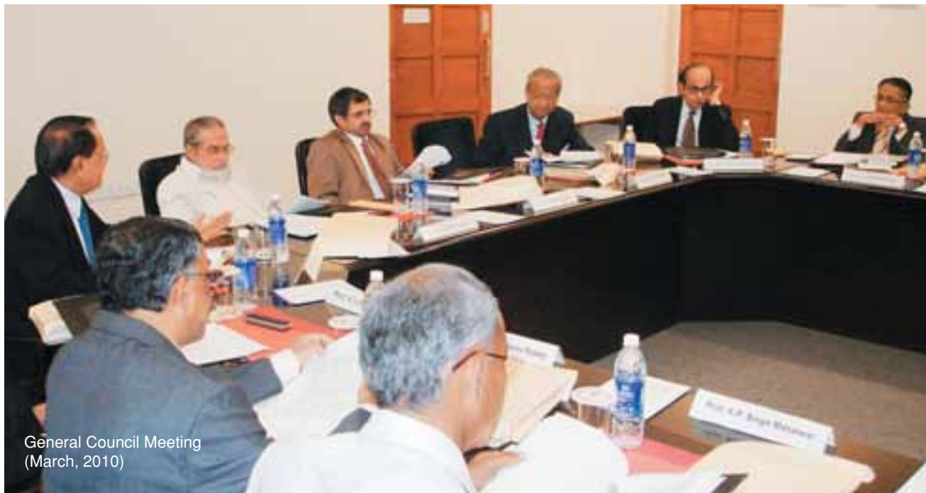
General Council Meeting (March, 2010)