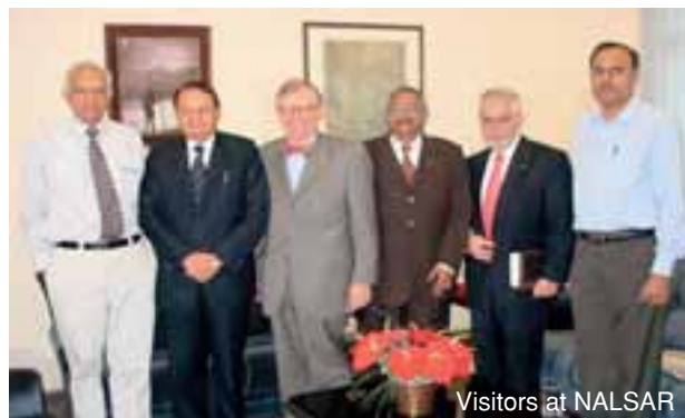
Visitors at NALSAR

NALSAR Campus is strictly No-Smoking Zone and consumption of Alcohol is strictly prohibited. The University strictly prohibits ragging, sexual harassment and any such conduct including moral turpitude and views these acts as serious issues for disciplinary proceedings which may lead to expulsion from the University and may also attract criminal prosecution. Violation of Code of Conduct invites