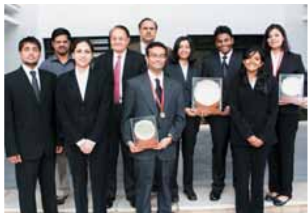
Bar Council of India National Moot Winners, 2010