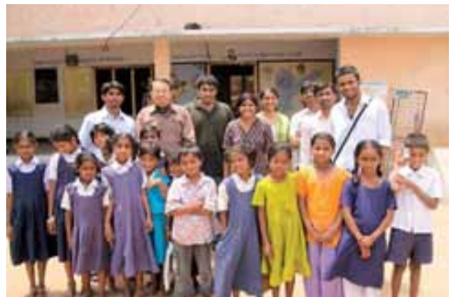
Medical Check-up Camp