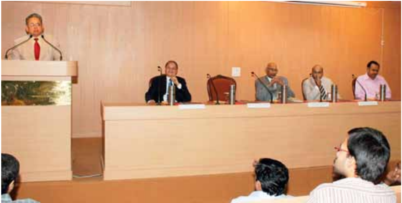
Hon'ble Shri Justice Dalveer Bhandari, Judge Supreme Court of India delivered Special Lecture on March 20, 2010.

LL.M. (NALSAR) Research Associate pyla.nari@gmail.com