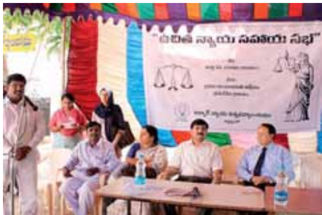
Legal Aid Camp