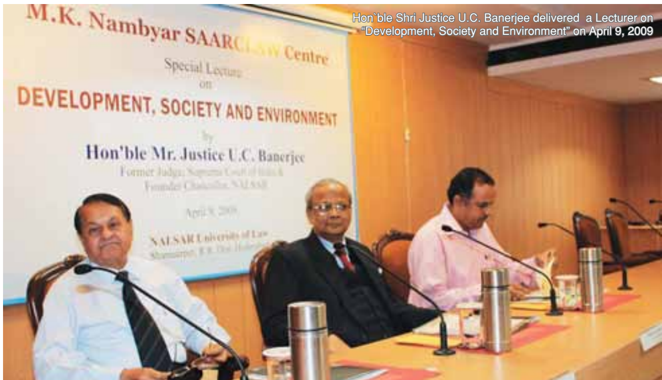
Hon'ble Shri Justice U.C. Banerjee delivered a Lecture on "Development, Society and Environment" on April 9, 2009