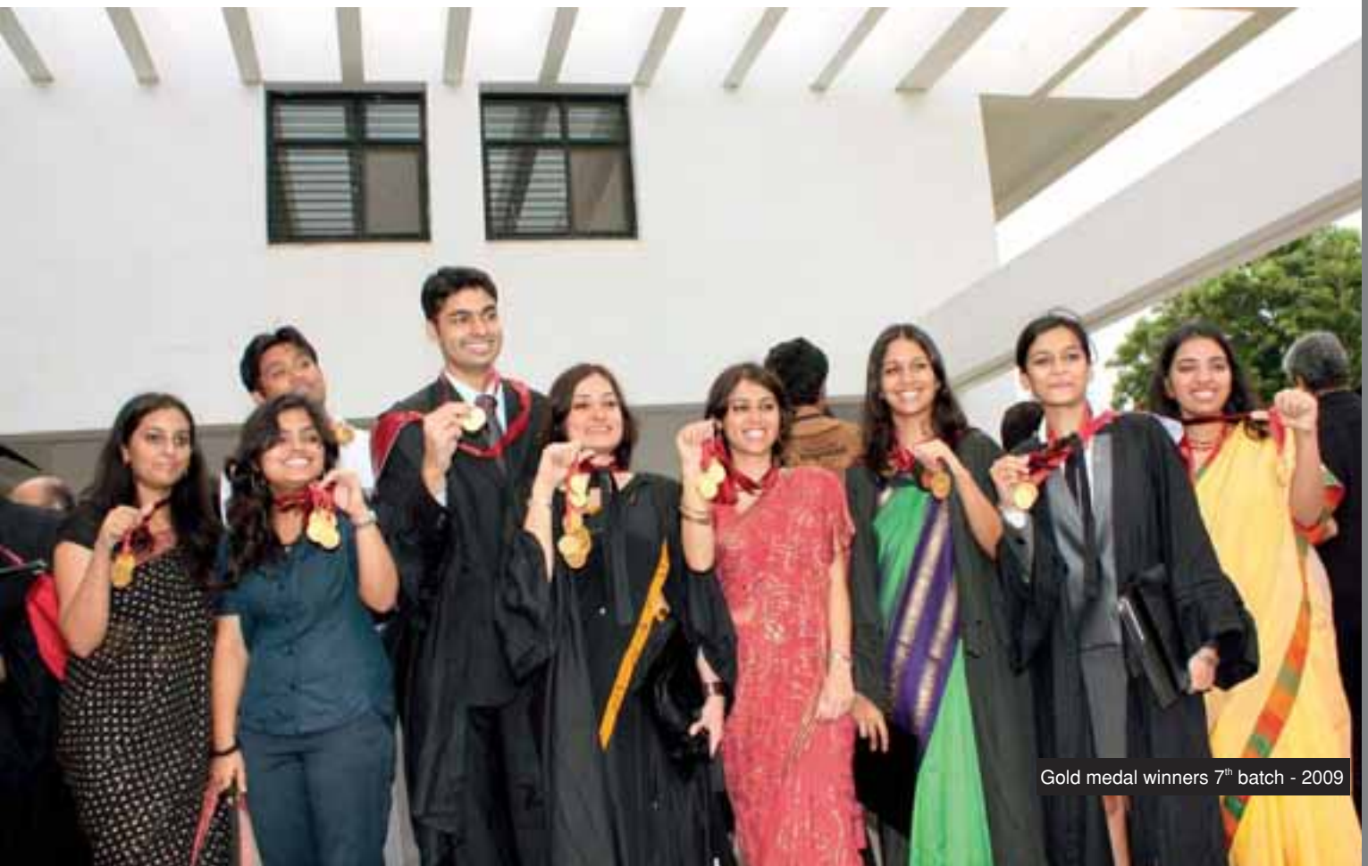
Gold medal winners 7 th batch - 2009