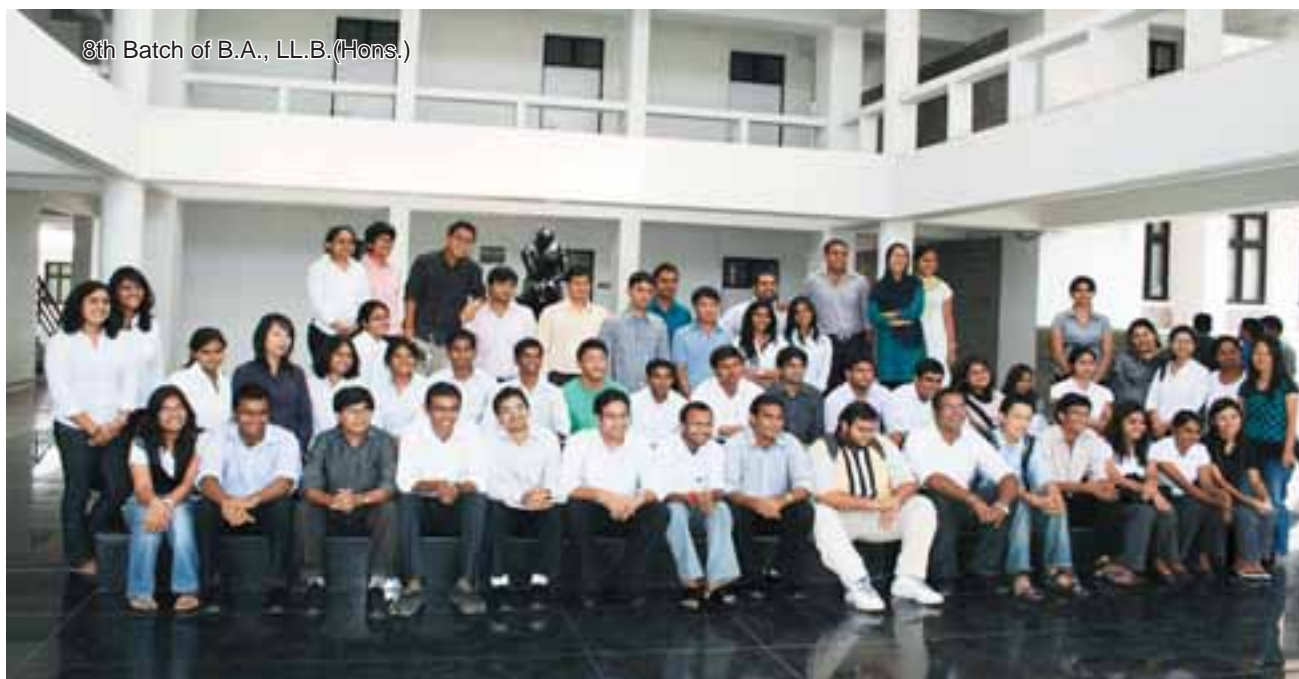
8 th Batch of B.A., LL.B. (Hons.)

Note: Candidates who get supplementary in any subject, in the qualifying examination in the relevant year, are not eligible for admission in that year.