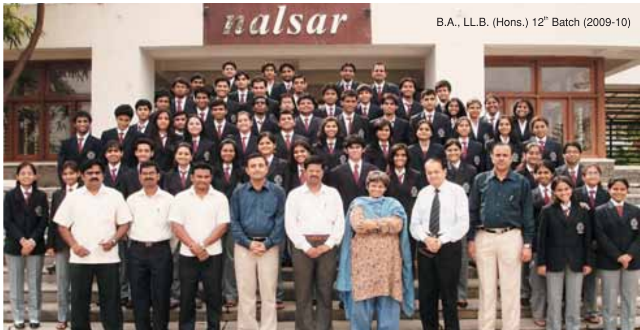
B.A., LL.B. (Hons.) 12 th Batch (2009-10)

The selected candidates for admission under this category will be informed individually. If there are vacancies, those seats will be filled by the All India General Category candidates in order of CLAT merit.