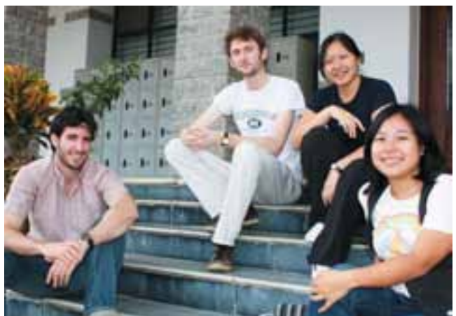
Foreign students on exchange programme at NALSAR

The objectives of the University are motivated by the goal of producing socially responsible lawyers. Social responsibility cannot be taught, it has to be learnt. The University, hence, devises programmes that will bridge the gap between classroom and social reality. The Placement Programme of the University is one such effort.