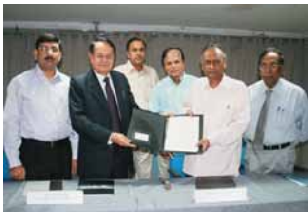
Signing of MOU with National Academy of Construction (NAC)

The Course Curriculum, Fee Structure, Course duration and academic details shall be announced shortly.