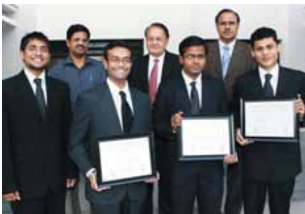
Surana & Surana National Trial Advocacy Moot Winners, 2009

In 2008, NALSAR team won the M.M. Singhvi Memorial International Moot Court Competition; Philip C. Jessup International Law Moot Court Competition [India (South) Rounds]; the 6 th Justa Causa National Moot Court Competition; the International Infrastructure and Construction Law Arbitration Moot Court Competition; and the NUJS-Herbert Smith Moot Court Competition.