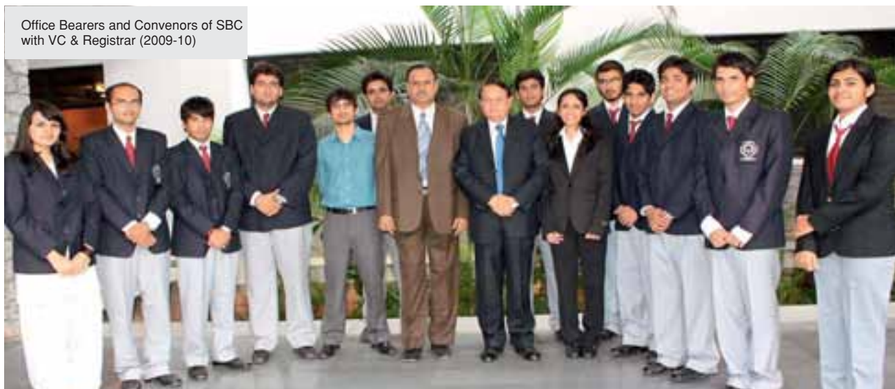
Office Bearers and Convenors of SBC with VC & Registrar (2009-10)