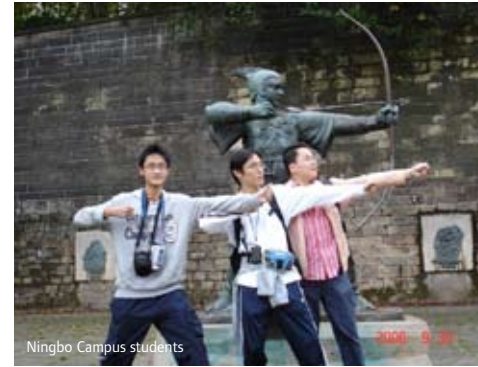
Ningbo Campus students

* if students apply by the specified deadline