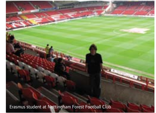
Erasmus student at Nottingham Forest Football Club